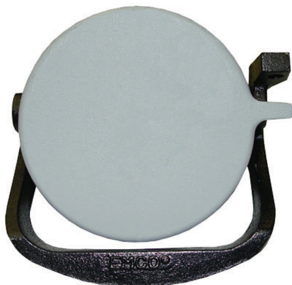
A0097-004LP Low Profile Fill Cap