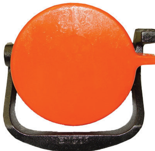
A0099-004LP Low Profile Vapor Cap

APPROVALS CARB EVR Executive Orders: VR-101, VR-102, VR-104, and VR-105